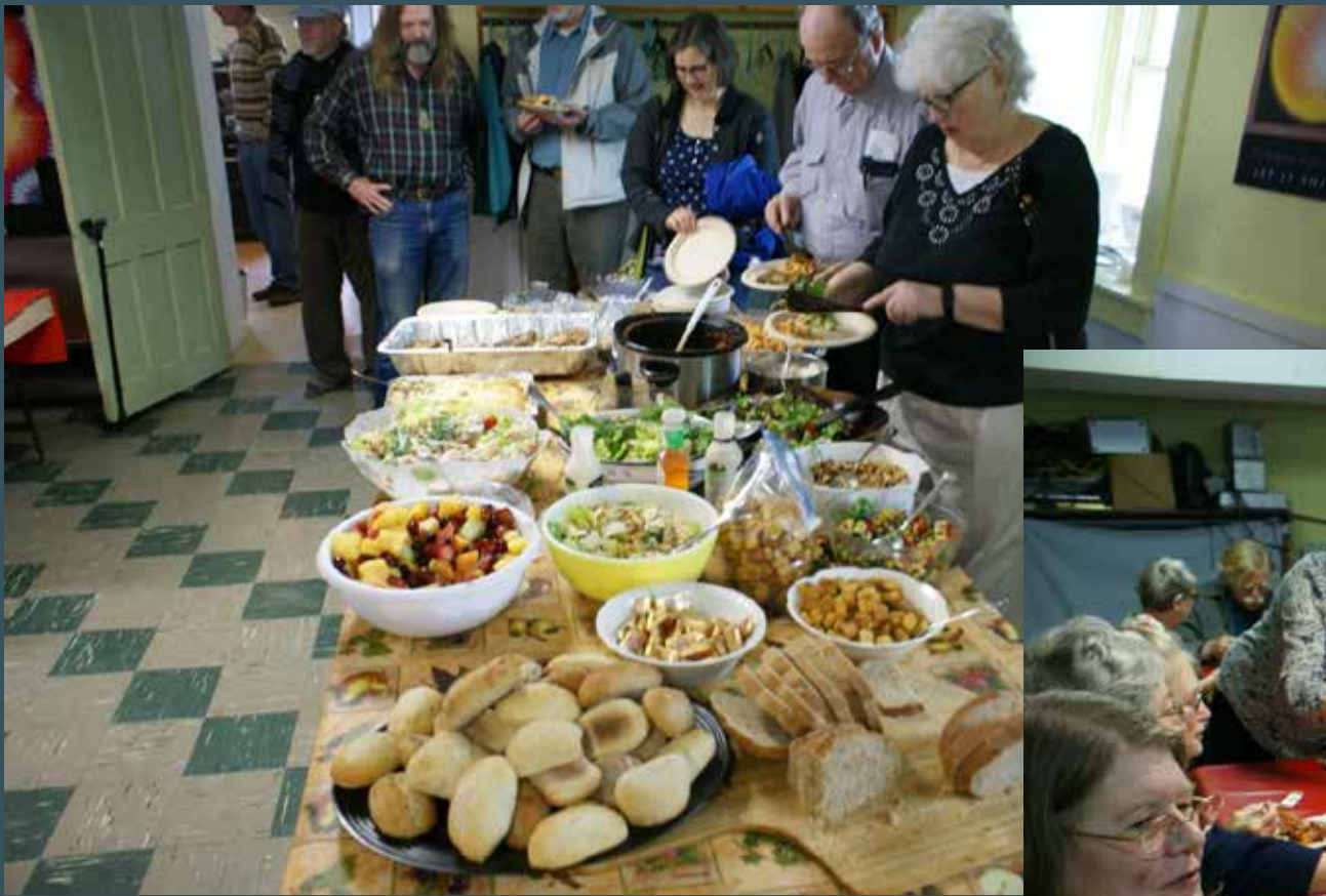
Sunday, May 22, 2016 Popular Ridge, NY Feasting with the local Friends.